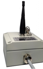
WT 7003 Radio Modem