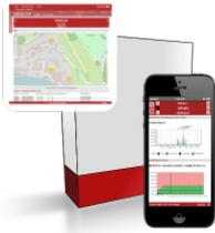
vibras.net Web Monitoring Solution