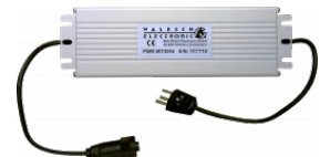
PWR WT 3004