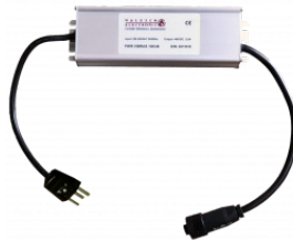
PWR VIBRAS 100/48