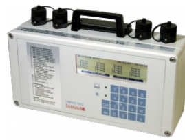
VIBRAS 7003 ME