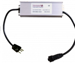
PWR VIBRAS 100/48