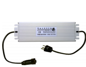
PWR WT 3004